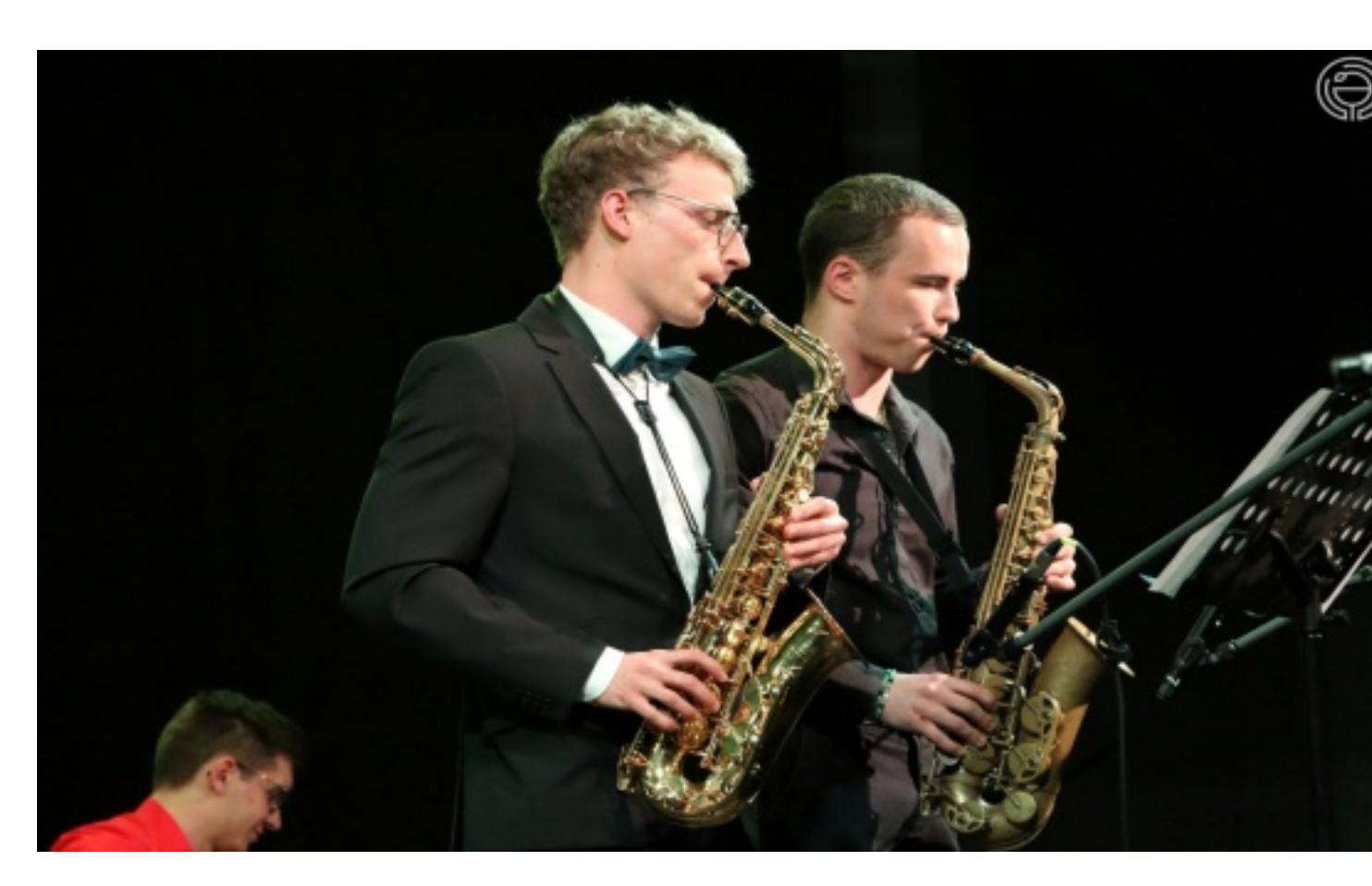
The musical theme of the concert was film music and a total of 36 musicians took turns on stage. Their performances were perfectly prepared and they were able to play beautiful songs that recalled unforgettable movie moments.