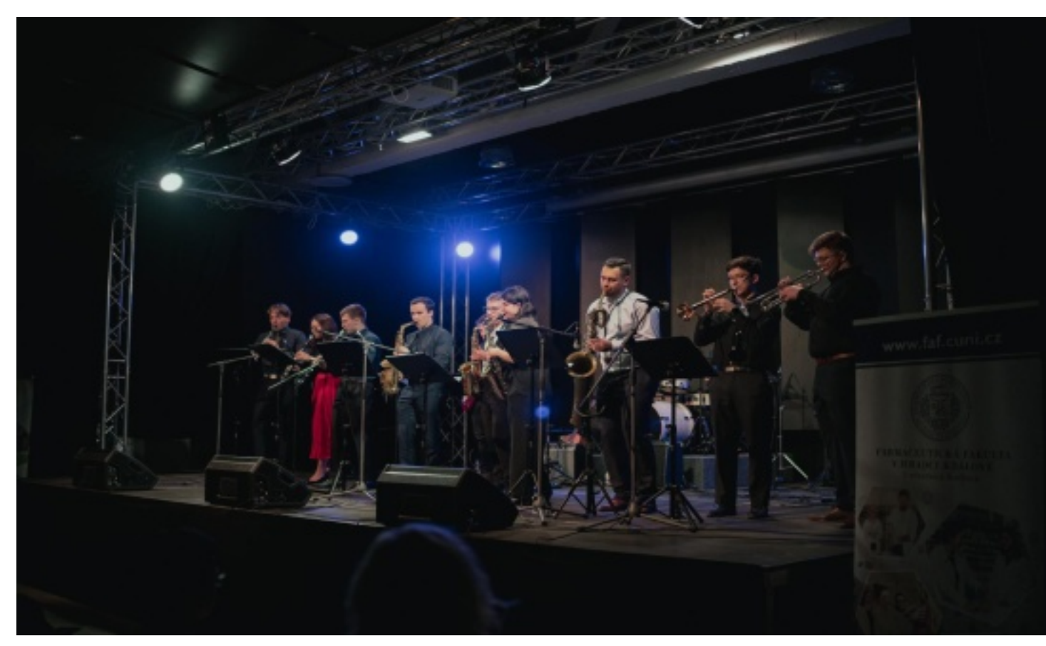
Medical and Pharmacy students performed a wide range of pieces on the theme of Back in Time, introducing visitors to the evolution of music up to the present day.