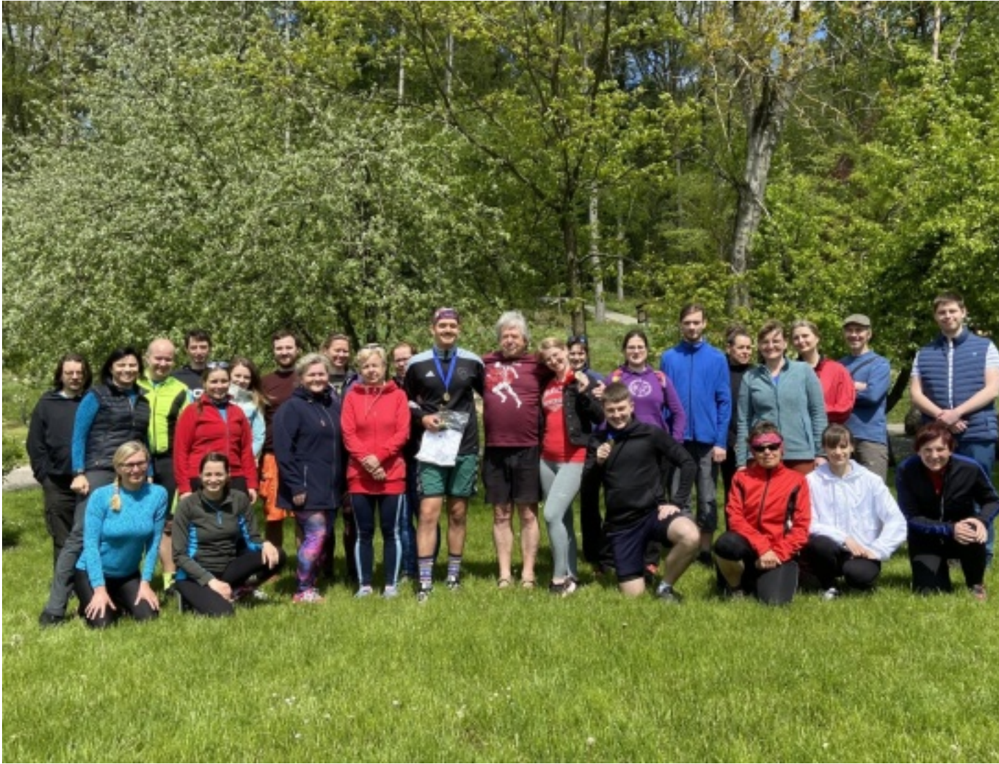
Bicycle trip to Kuks